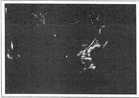
Figure 1. Cerclage suture is located in the upper third of the cervix.